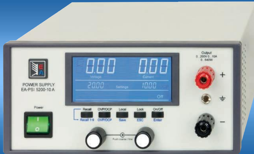
EA-PSI 5200-10 A