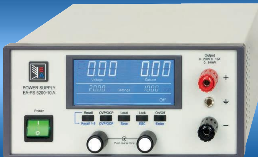
EA-PS 5200-10 A